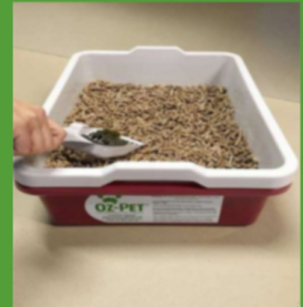
SCOOP OUT THE SOLIDS After scooping out the solids The tray is ready to use

Once the consumer tries it, and figures out that they are only throwing away the soiled litter, they realise they are saving money. They are only topping up the wood pellets rather than throwing away a full tray of litter at each change. This is extremely relevant today for your customers with the current Cost of Living Pressures.